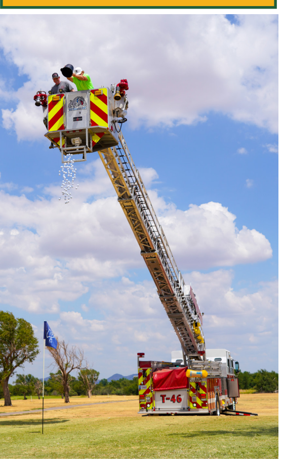
Altus Fire Department Ladder Truck during golf ball drop